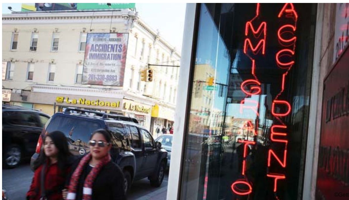
Pathway to citizenship: Hispanic residents walk by a law office specialising in immigration