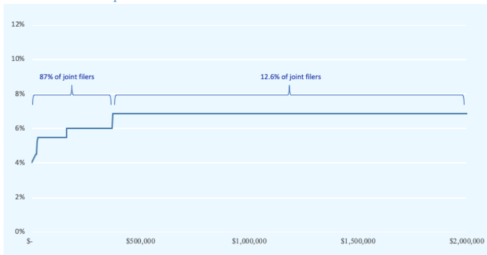
New York personal income tax rates on 99.5% of married filers